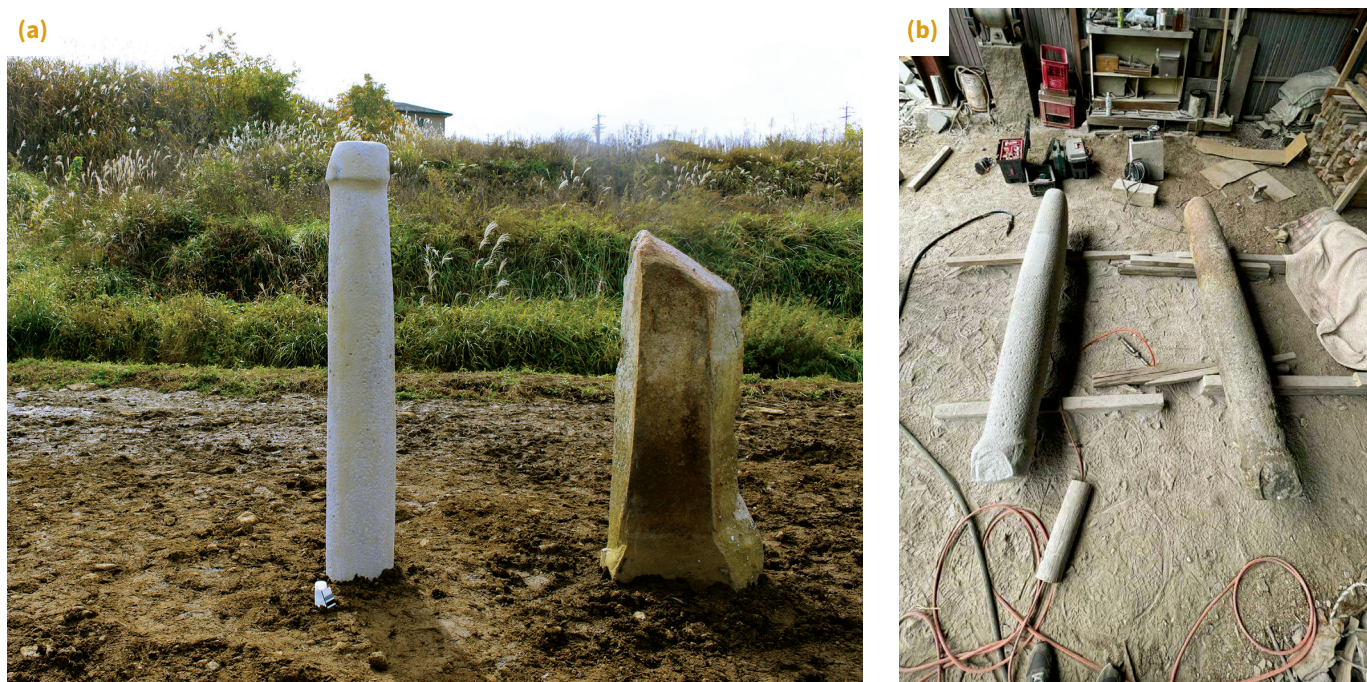
Fig. 2 — The Kitazawa Sekibō and the application of silicone coating to the monument: (a) overall appearance; and (b) the coating shop.

silicone coating could be applied to its surface. This treatment made it possible to display the object outdoors under severe environmental conditions, such as snowfall, rainwater exposure, freeze-thaw cycles, and significant temperature fluctuations, while preserving the original texture and color tone of the stone surface.